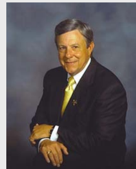
Sheriff Jimmy Thornton

Sampson County Sheriff's Office 112 Fontana Street Clinton, NC 28328 www.sampsonsheriff.com (910) 592-4141 – Office (910) 592-8641 - FAX