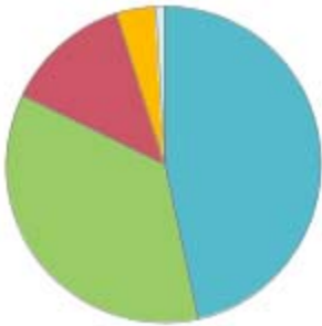
Table 9 Clinton City Schools Racial Demographics